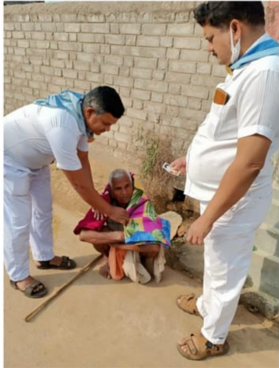
BLANKET DISTRIBUTION AT PALLAHARA