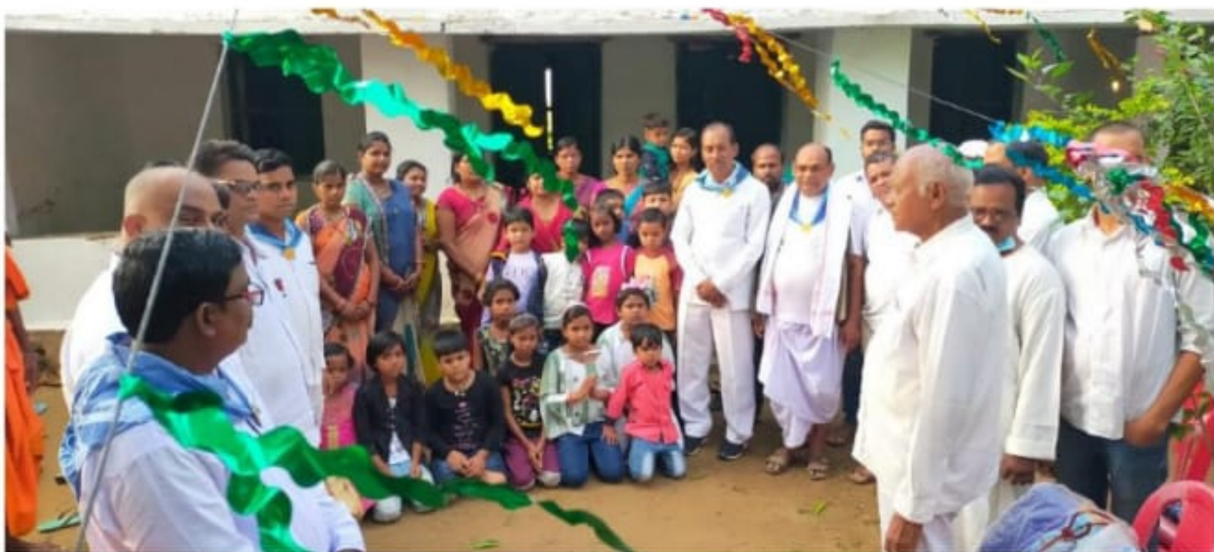
BALVIKAS STUDENTS OF CHATTABAR SAMITHI