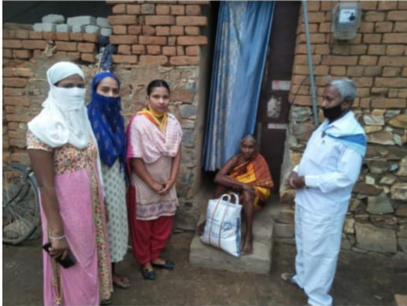
AT CHASAGURUJANG SAMITHI

AMRUTA KALASA DISTRIBUTION - Amruta Kalasa Distribution programme was most popular and essential service work during the entire year. There was 96 members of Amruta Kalasas have been distributed during the same. Some Sevadals distributed it among the needy people by doing proper survey. This