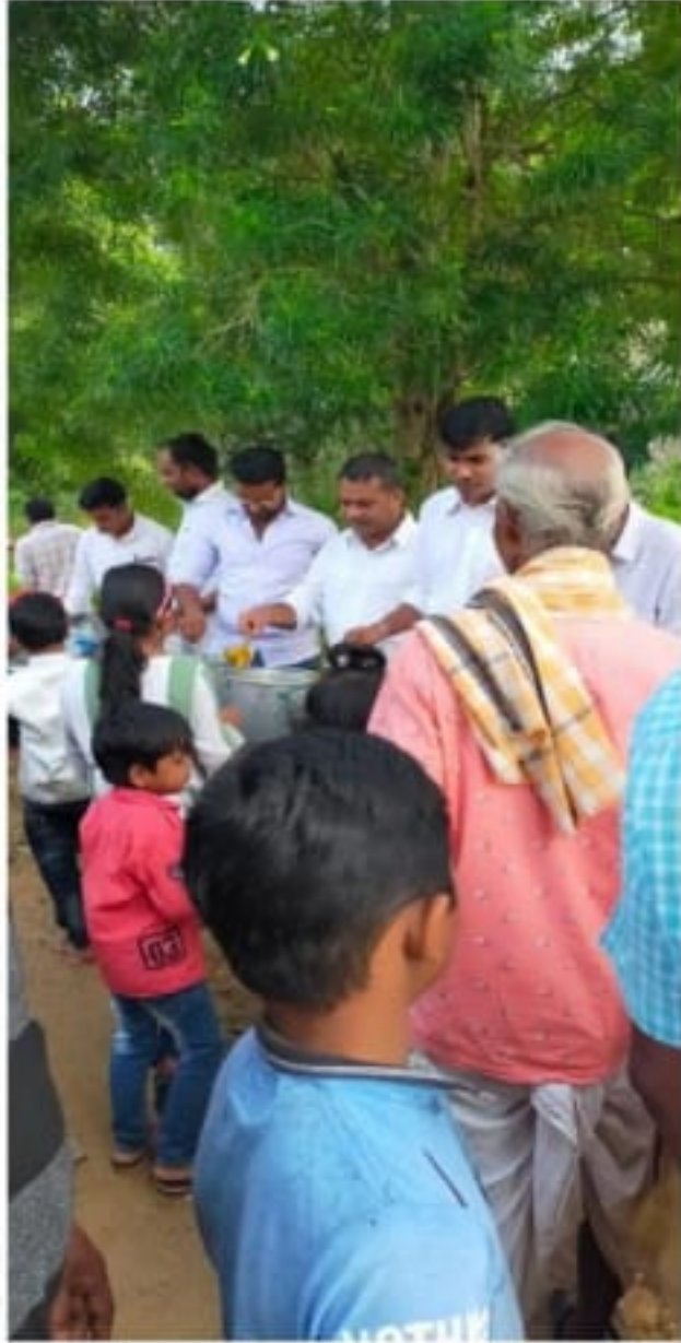
NARAYAN SEVA AT CHATTABAR